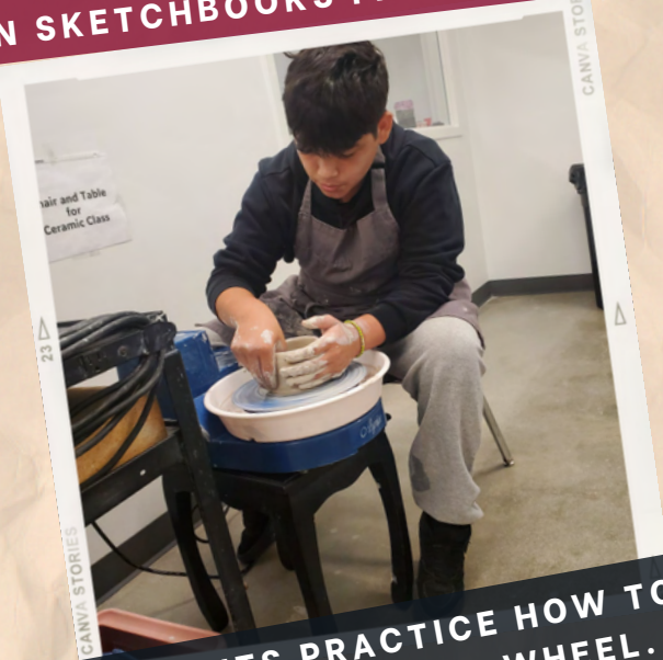
STUDENTS PRACTICE HOW TO USE THE POTTER'S WHEEL.