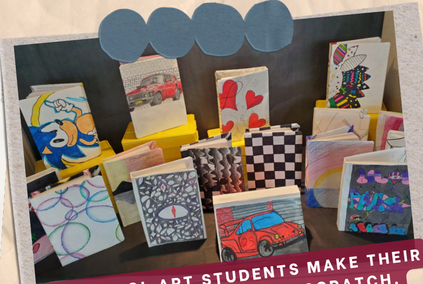
HIGH SCHOOL ART STUDENTS MAKE THEIR OWN SKETCHBOOKS FROM SCRATCH.