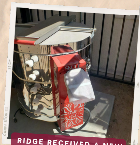
RIDGE RECEIVED A NEW CERAMIC KILN FOR CERAMIC CLASS.